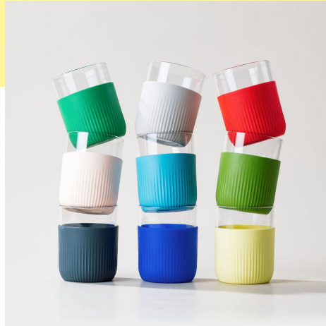
The original cup | 28 cl The most playful personalization

To implement the essentials of reuse with the same design signature